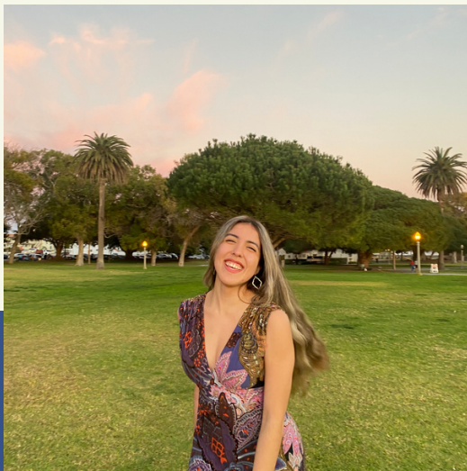
VICTORIA STUDENT PROGRAM ASSISTANT